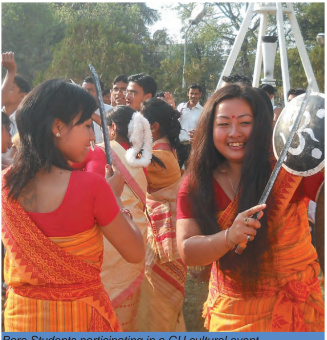
Boro Students participating in a GU cultural event