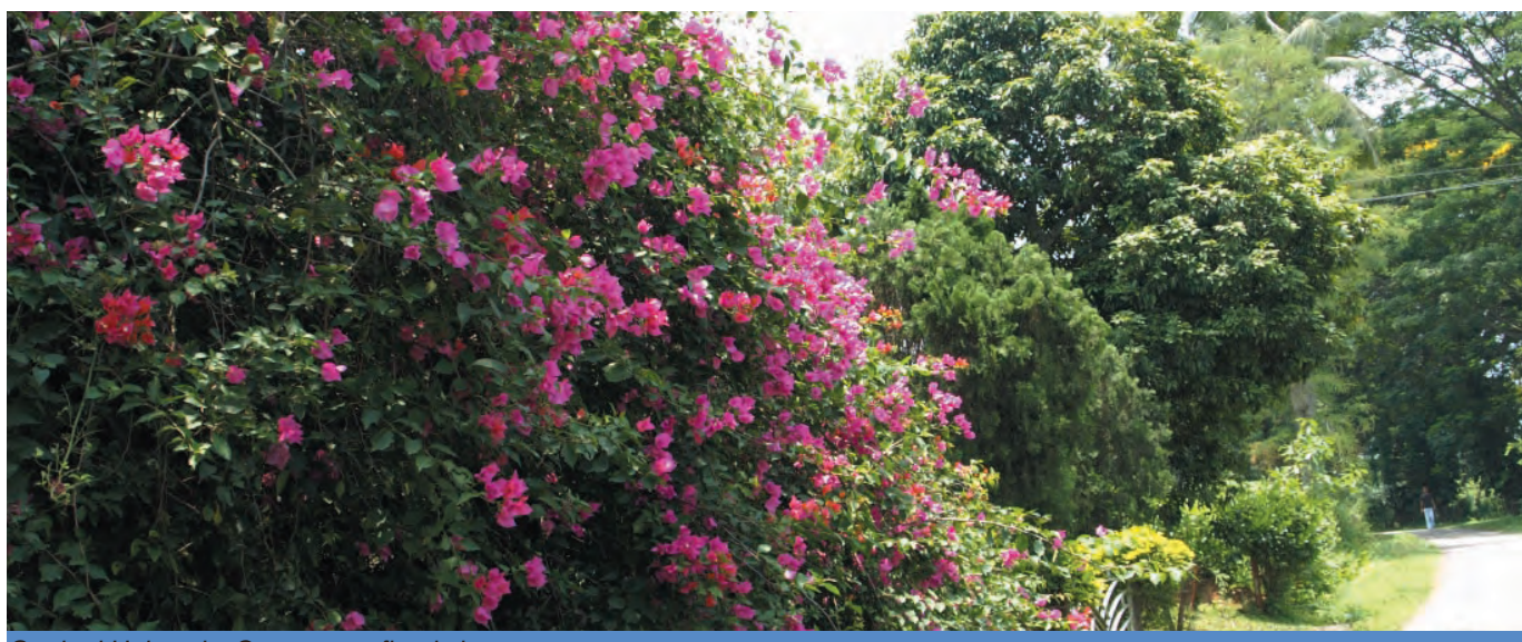
Gauhati University Campus - a floral view

The Department of Education is located to the south of the Faculty House and the MBA Department (please refer to B2 in Map 1 ).