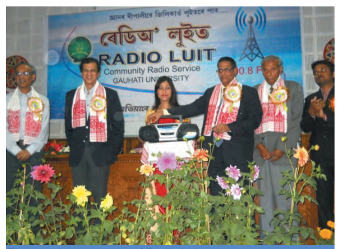
The opening ceremony of Radio Luit

RADIO LUIT, the Community Radio Station of Gauhati University has been set up and stationed at the Institute of Distance and Open Learning, Gauhati University. The station was launched on 1st March, 2011 and operates at 90.8 FM daily from 8AM to 8PM. Last year, Gauhati University obtained the license and frequency 90.8 FM from the Ministry of Information and Broadcasting, Government of India for establishing the Community Radio Station in its campus.