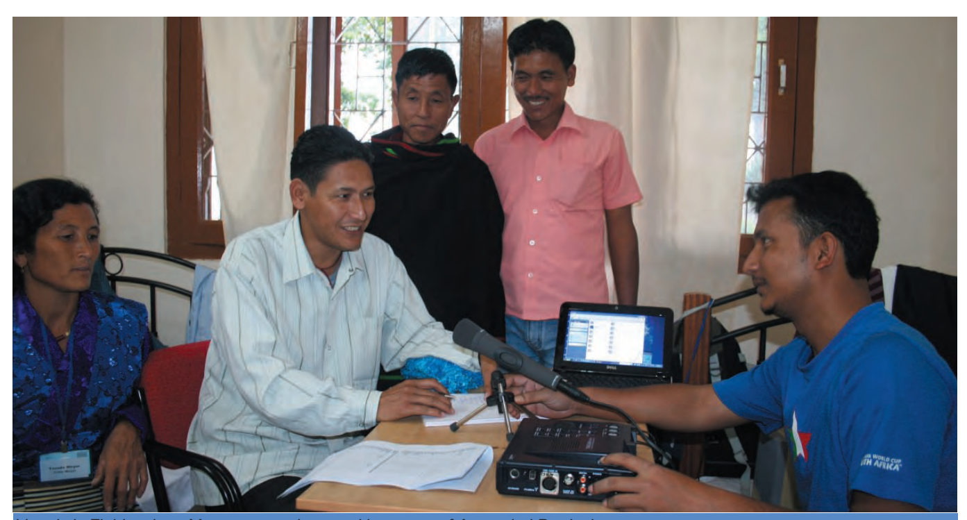
inguistic Fieldwork on Meyor - an endangered language of Arunachal Pradesh.

The Department of Linguistics is located in the two-storeyed building behind the Department of Business Administration and to the western side of the Department of Education (please refer to B2 in Map 2 ).