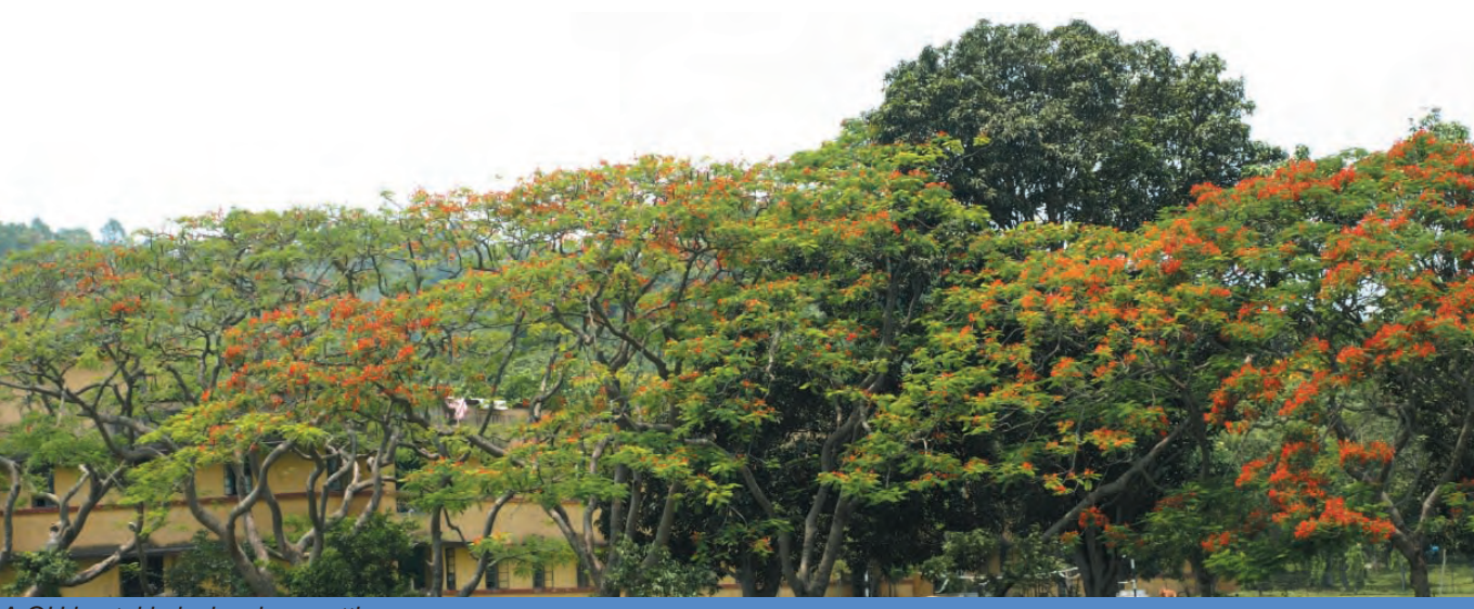
A GU hostel in lush sylvan setting

The Department of Foreign Languages is located in an Assam-type house that is situated to the south of the Main Arts Building, along its left wing. It can be reached from the northern entrance of the Main Arts Building or alternatively, from the path leading from the eastern end of that building (please refer to Map 2 ).