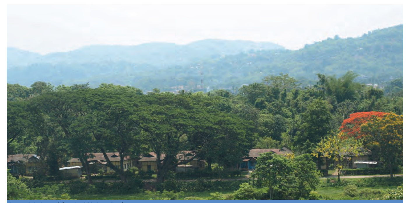
An aerial view of Gauhati University Campus