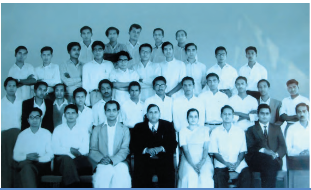
An archive photograph of teachers and students of the Mathematics Department in the early 1960's