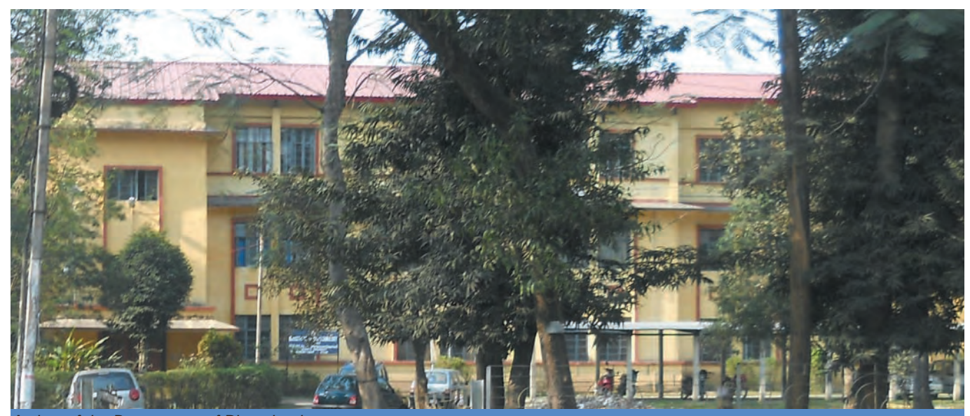
A view of the Department of Biotechnology

The Department of Biotechnology is housed in the right wing of a two-storeyed building situated to the west of the K.K. Handiqui library and Science canteen building. (please refer to A1 in Map 1 ).