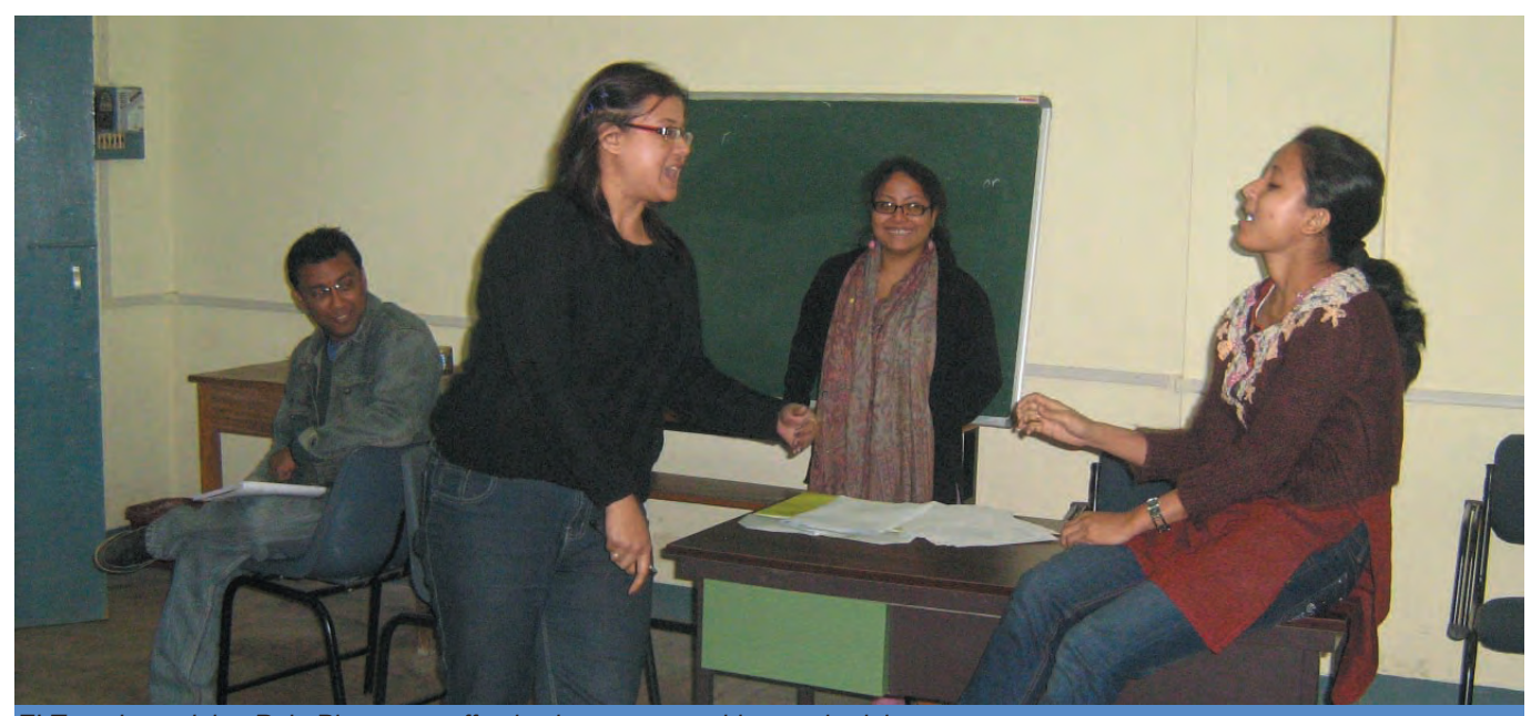
ELT students doing Role Play as an effective language teaching methodelogy

The Department of English Language Teaching is located in the two-storeyed building behind the Department of Business Administration and to the western side of the Department of Education (please refer to B2 in Map 1 ).