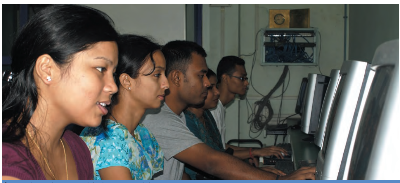
Geography students at work in the computer lab

The Department of Geography is located on the south of NH 37 towards the western part of the University campus. (please refer to B1 in Map 1 ).